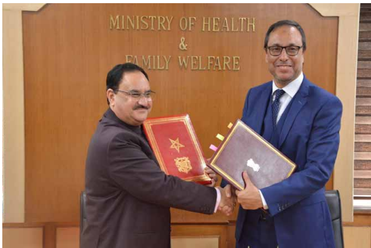
Meeting of Hon'ble Union Minister for Health & Family Welfare Shri J.P. Nadda with H.E. Health Minister of Morocco on 14 th December, 2017 and signing of MoU on Health Cooperation and Telemedicine