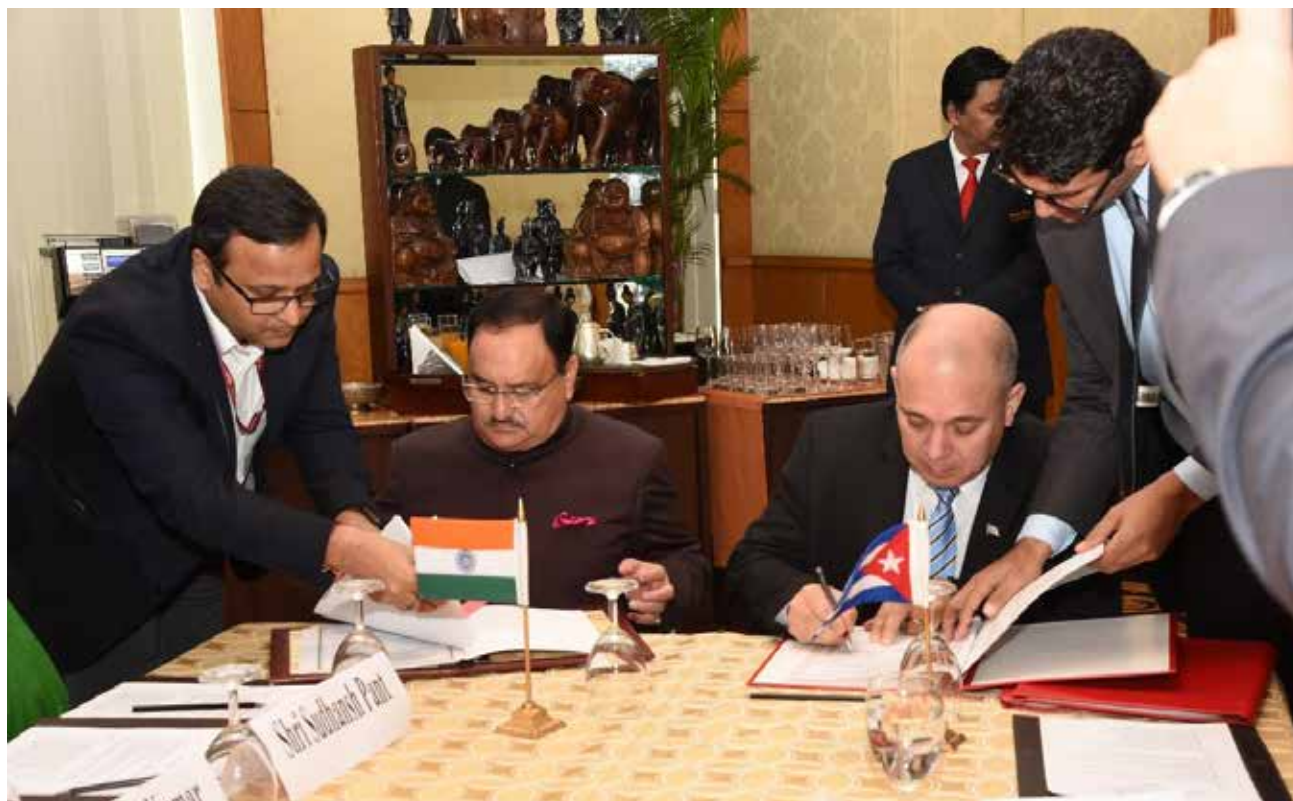
Meeting of Hon'ble Union Minister for Health & Family Welfare Shri J.P. Nadda with H.E. Health Minister of Cuba, Dr. Roberto Morales Ojeda on 6th December, 2017