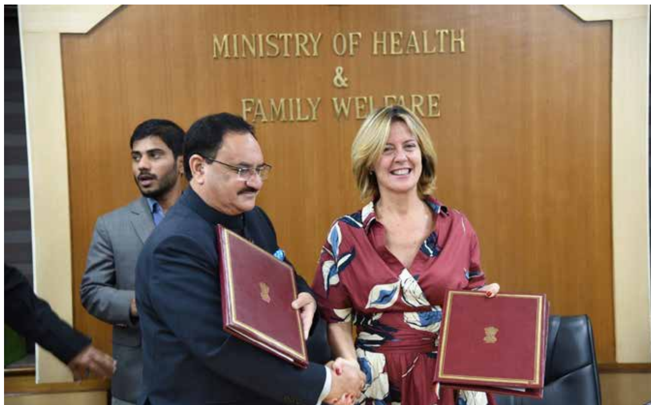
Meeting of Hon'ble Union Minister for Health & Family Welfare Shri J.P. Nadda with H.E. Health Minister of Italy, Ms. Beatrice Lotenzin on 29 th November, 2017