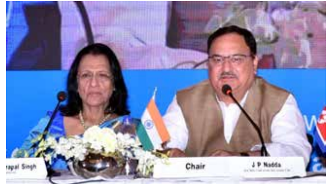
Hon'ble Union Minister for Health & Family Welfare Shri J.P. Nadda with Regional Director of WHO-SEARO Dr. Poonam Khetrpal Singh

Activities under WHO are funded through two sources:- The country budget which comes out of contributions made by member countries and extra budgetary resources which come from (a) donations from various sources for general or specific aspects of