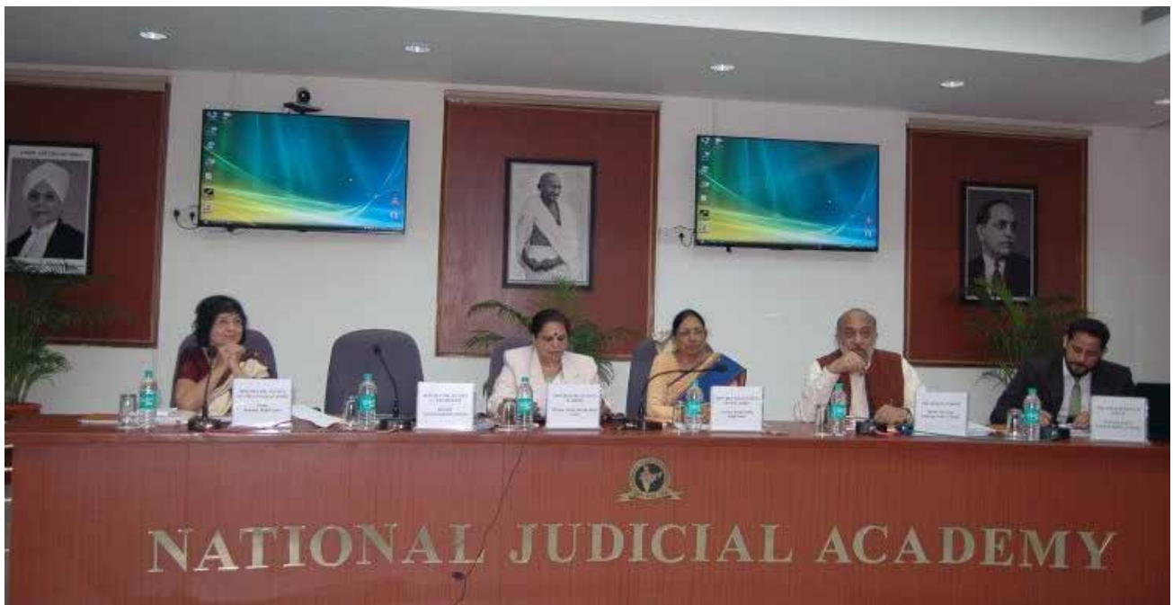
Orientation Programme for the Magistrates for implementation of PC & PNDT Act on 4 th & 5 th Feb, 2017 in Bhopal