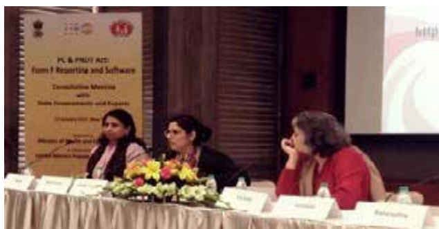
Joint Secretary(RCH) addressing the participants during the workshop consultation meeting for the standardisation of online Form F