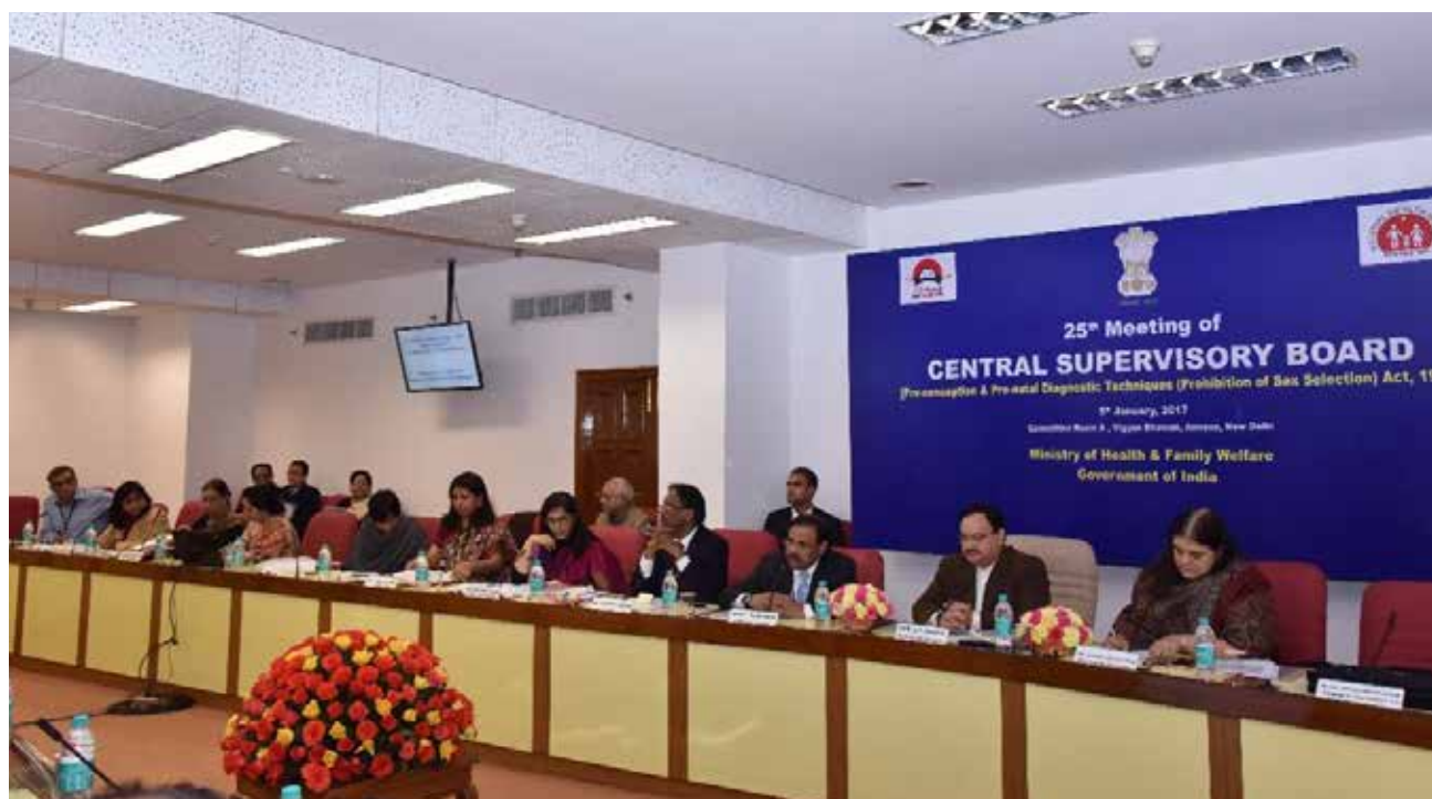
25 th Central Supervisory Board meeting held on 5 th January, 2017