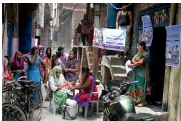
Mission Indradhanush activity in urban slums