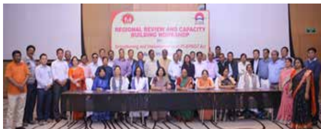
Regional workshop for North Eastern States in Kolkata on 3 rd March, 2017

October, 2017. Further, a session for SOGs for district authorities is also planned for all the four regional review meetings that are commencing from November, 2017 onwards.