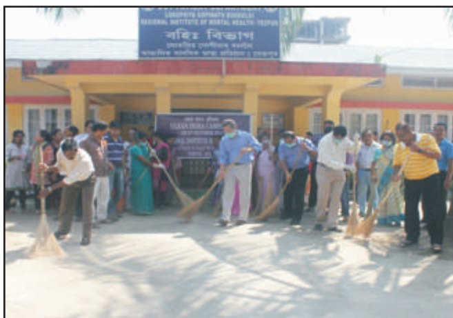
All officials, faculty, staff and students participating in the Clean India Campaign on 02.10.14