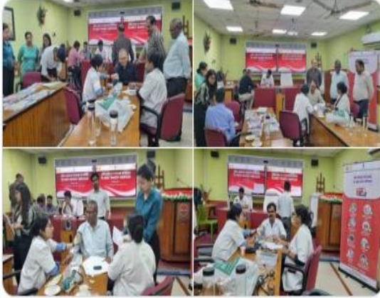
You and IndianOil Pipelines Division

IndianOil Eastern Region Pipelines @IOCL_ERPL · 5h #100DaysTBCampaign के तहत, @IndianOilI पूर्वी क्षेत्र पाइपलाइन्स, कोलकाता @IOCL_ERPL में नि-क्षय शिविर (टीबी जांच शिविर) आयोजित किया गया, जिससे #TBMuktBharat के प्रति हमारी प्रतिबद्धता और सुदृढ़ हुई। @TbDivision @PIB_India @MoHFW_INDIA