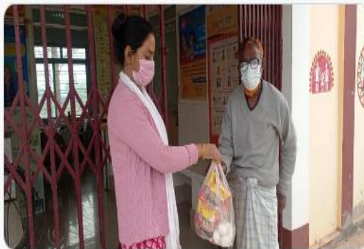
KHPT and 4 others

Food Basket distribution to TB Patient for Nutritional support at Rahimpur AAM under Boxanagar CHC, Sepahijala District Tripura #TBMuktBharat #TBMuktTripura @PMOIndia @tripura_cmo @JKSinhaIAS @kirangitteias @Dr_SamitRC @DrRaghuramRao @nishantjeph @MoHFW_INDIA @TbDivision @TBHDJ