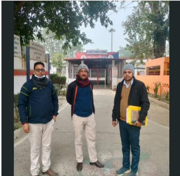
TB Mukht Bharat

23h शिवान मंडल कारा में दिसंबर और जनवरी में 275 कैदियों का हुआ टीबी स्क्रीनिंग, जबकि छह में पाया गया टीबी संक्रमित: जेल में बंद कैदियों की टीबी जांच व पहचान सुनिश्चित करना सार्थक पहल. सिविल सर्जन 100 दिन टीबी अभियान के तहत कैदियों का पोर्टेबल एक्सरे मशीन द्वारा किया गया स्क्रीनिंग... See more