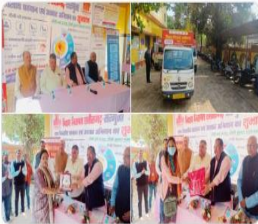
You and 3 others

District TB Elimination Centre Sarguja @TbSarguja · Dec 7, 2024 ... 100 दिवसीय निष्कृय निरामय पहचान एवं उपचार अभियान का शुभारंभ जिला सरगुजा छत्तीसगढ़