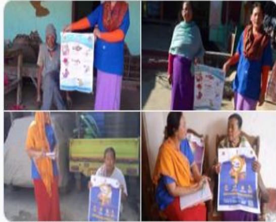
Ministry of Health and 4 others

TB Mukht Bharat - Imphal East @NtepImphalEast · 2h TB Screening and house-to-house awareness campaign on #100DaysOfTBCampaign by ASHAs of HWC Naharup Makhapat, Imphal East.