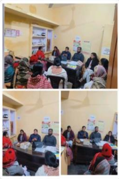
CMO VARANASI and 4 others