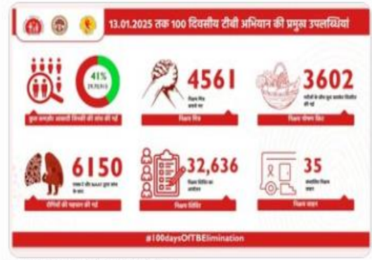
Ministry of Health and Chief Minister, MP

@DrMohanYadav51 @rshuklabjp @nsp2106 @JansamparkMP #TBMuktBharat