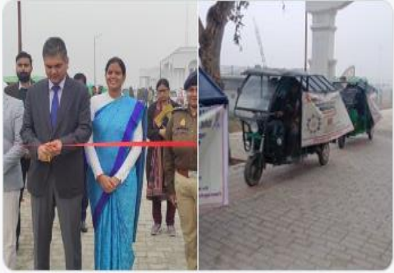
PMO India and 9 others