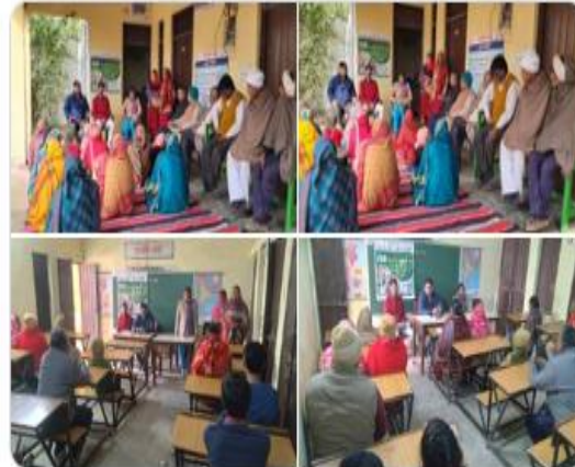
1 1 3

TB Mukht Bharat - Yamunanagar - Haryana @ntepynr - 3h ... During 100 days Ni-kshay Shivir Campaign aware Sarpanch, Gram Sabha Members & General Public of Gram Sabha Ghilaur, Daulatpur, TU Radeur, Distt Yamunanagar (Haryana). #TBMuktBharat