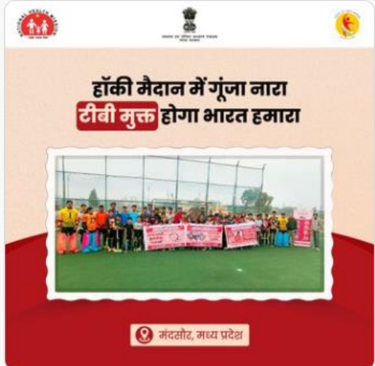
PMO India and 6 others

मध्य प्रदेश के मंदसौर जिले में 100 दिनों के सघन #TBMuktBharat अभियान के अंतर्गत हॉकी के मैदान में जागरूकता के लिए लोगों को यापथ दिलाई गई। इसके तहत 'दौड़ेगा मंदसौर, हारेगा टीबी' कार्यक्रम का भी सफल आयोजन किया गया।