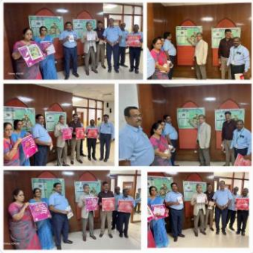
You and 8 others

MADRAS FERTILIZERS LIMITED, MANALI, CHENNAI... @Chenna... - 2h ... 100 days intensified Campaign on TB Elimination in Startup programme in MFL held on 13-01-25. CMD ,GM-P&A,DGM ,Manager-IR &W , Addl Manager -PRO & Nodal officer and CMO, Dy.Manager-HR and Many others took part #tbelimination #TBMuktBharat #EndTB #NikshayMitra @narendramodi