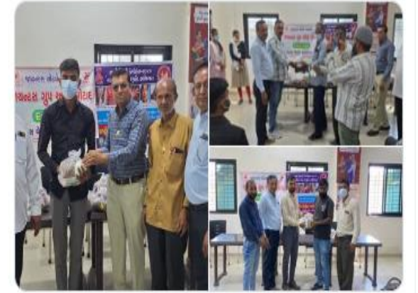
You and 5 others

DTO BOTAD @NTEP_Botad · 8h XI ... आज़रोज 100 दिवस सघन टीबी अभियान अंतर्गत टीबी रोकथाम पोषण सहाय माटे CDHOश्री तथा DTOश्री ना मार्गदर्शनया निक्षय मित्र जायंटस ग्रुप ओइ ब्योटाटना सहयोगया 30 टीबी रोकथाम पोषण कोट वितरण करवायां आयु.