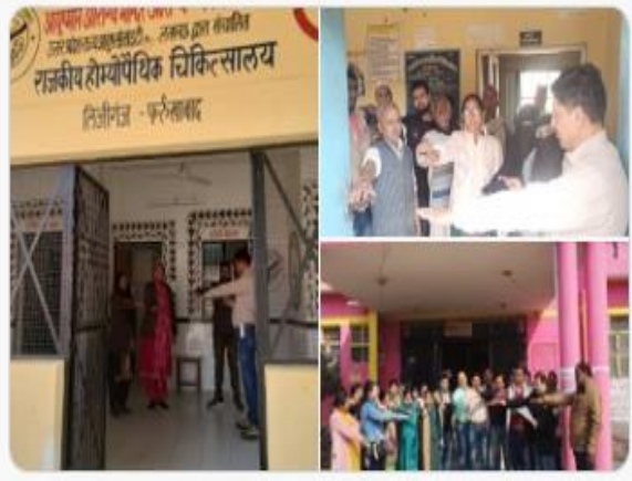
You and 9 others

DTO FARRUKHABAD # TB Mukta Bharat @DtoFarrukhabad · 2h XI ... 100 दिवसीय सघन टीबी अभियान के तहत आज होम्योपैथिक एवं आयुर्वेदिक चिकित्सालय में समस्त अधिकारियों एवं कर्मचारियों को भारत को टीबी मुक्त बनाने में अपना सहयोग प्रदान करने हेतु शपथ दिलाई गई। @ntep_UP @CMOfficeUP @DMFarrukhabadUP @TbDivision #TBMuktBharat