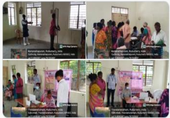
You and 8 others

NTEP Puducherry @NtepPuducherry · 4h XI ... 100 day TB campaign - Screening camp conducted at Ramanathapuram and Thondamantham area, Puducherry today by our NTEP staff. 208 individuals were screened today and spot sputum samples collected from 18 individuals.